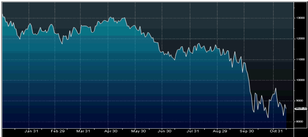
Figure 2. Dow Jones Industrial Average in 2008 through October 31st

These opportunities surface during times when the market reacts to shifting policy mandates or new information regarding our collective economic future. As portfolio managers, we evaluate the validity of these reactions and formulate investment strategies to capitalize on pricing anomalies for bonds we deem attractive. By focusing exclusively on bonds, we can effect in a matter of minutes transactions that