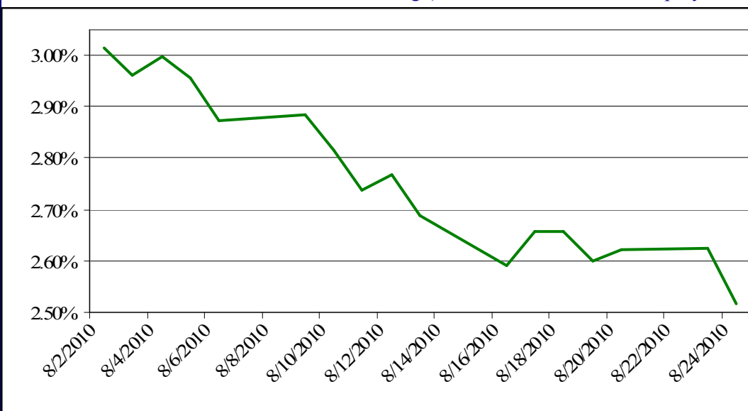
Figure 1. BFV U.S. Treasury 10-Year Yields (August 1—24)