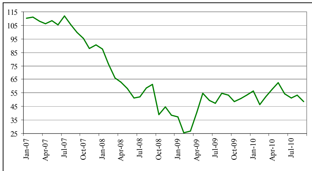
Figure 1. Consumer Confidence Index levels from January 2007-September 2010

driven by the general contraction of credit and the lack of final demand. As such, the Federal Open Market Committee once again left the Fed Funds Rate unchanged (0-0.25%) on September 21 st in an attempt to encourage economic activity. However, a low Funds rate will not be enough. The