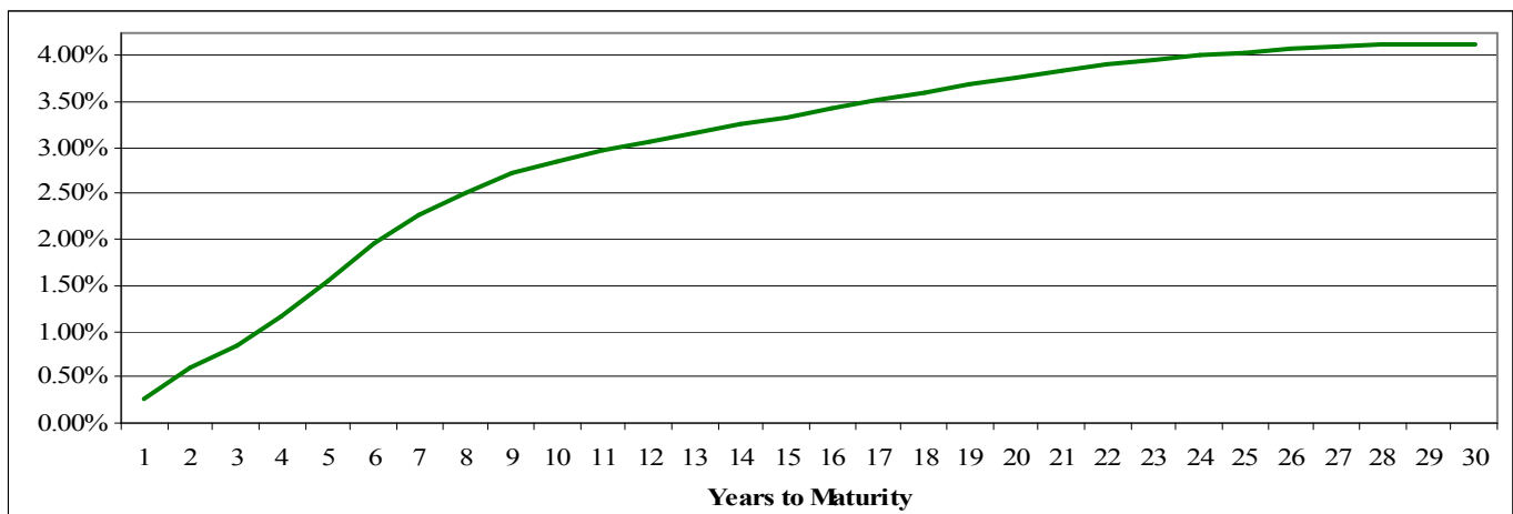
Figure 2. AAA Muni Bond Yields from 1- to 30-Year Maturities as of 02/08/2010

The landscape of the economy today looks much as it did six weeks ago at the writing of our last newsletter. Hints of recovery are emerging, albeit slowly and sporadically. The headwinds presented by continued high unemployment and rising foreclosure statistics are likely to weigh on recovery and should keep the Fed at bay for the time being. We take the Fed at their word and do not expect rate increases to be a near term likelihood. Therefore, Caprin will continue to manage the duration of our intermediate municipal bond portfolios to a level that is neutral to our